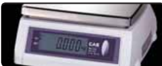
Optional Rear Display