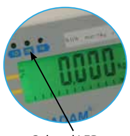
Colored LED indicators