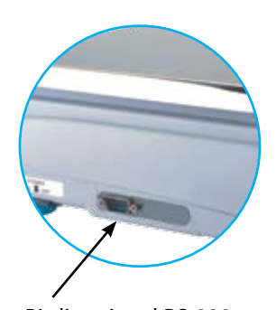
Bi-directional RS-232 interface to output the results to a printer or computer